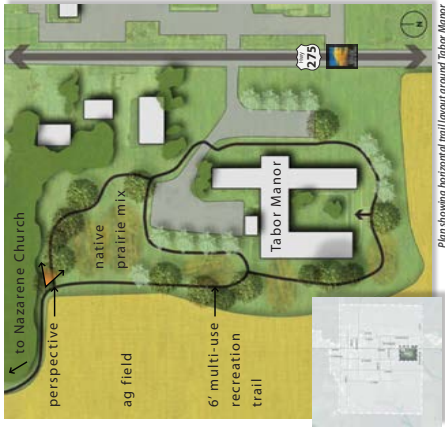
Plan showing horizontal trail layout around Tabor Manor

Many residents in Tabor have voiced the need for a comprehensive trail system or loop. The sidewalks in town do not allow for this desired circulation. With a comprehensive look into existing sidewalks, their conditions, and popular walking routes, Tabor can begin to vision a sidewalk reinvestment plan.