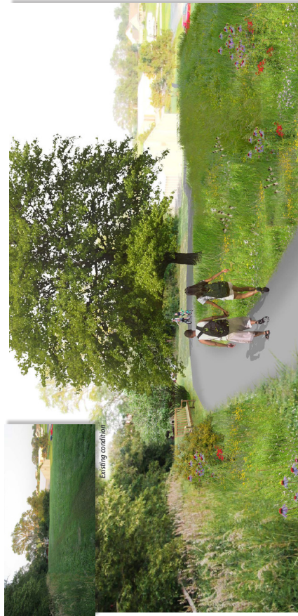
Perspective north of Tabor Manor showing a recreational trail which connects to Center Street (looking east)