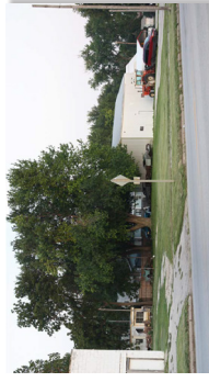
Existing condition of lot south of Kempton's Garage (looking southeast)