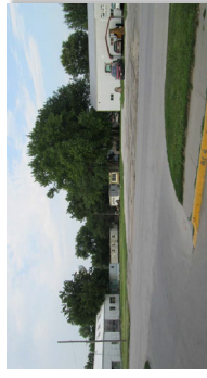
Existing condition further south of Kempton's Garage (looking northeast)