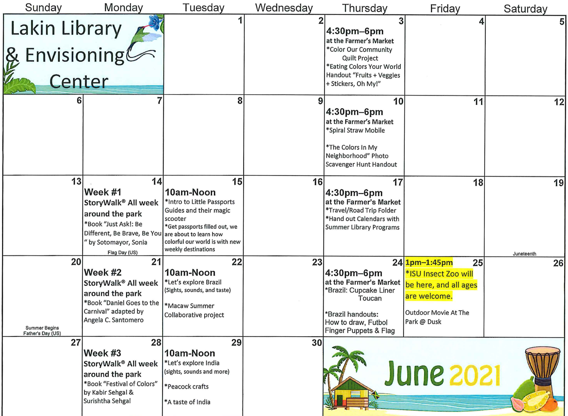
Reading Colors Your World.....Summer Library Programs & Events